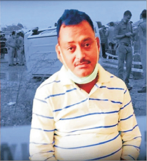
incident before arresting him on July 19. The SSP said that during his house